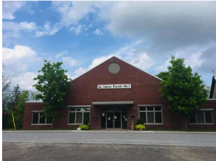
St. James Parish Hall Carleton Place